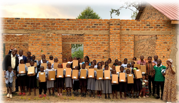
Kaccumu & Kabwasa Christmas Shoebox Distribution