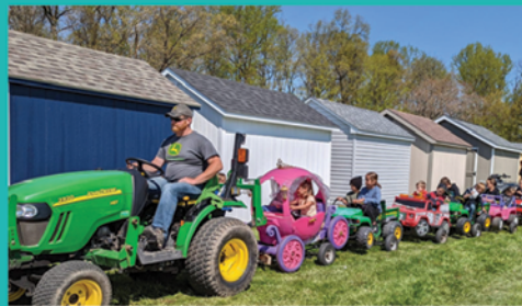
Activities for the children