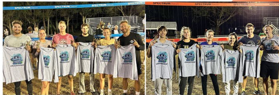
A Division Champs

The Volleyball Tournament is still growing! We had the most teams ever at 118! Thanks to all who show up to make the atmosphere and interaction what it is.