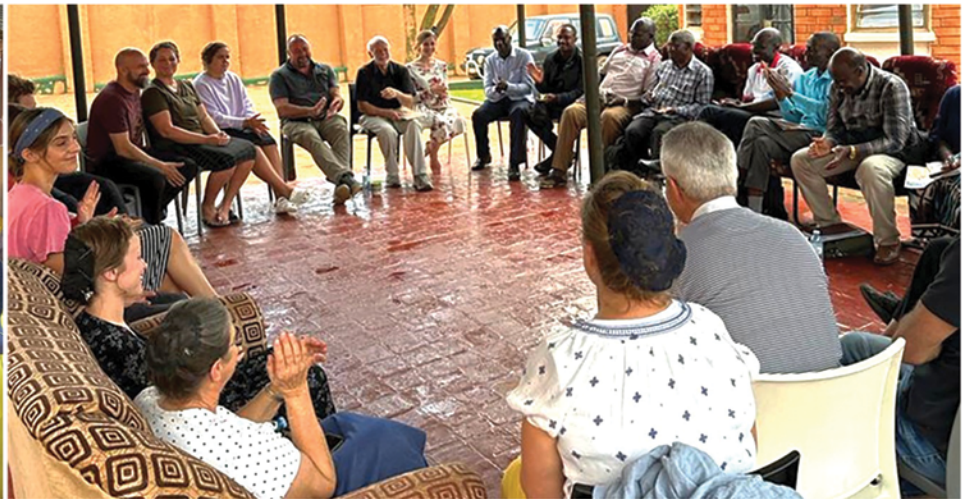
Meeting with Ugandan Pastors