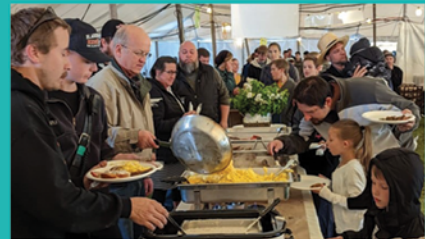
Great food all weekend