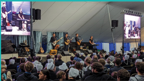
Friday & Saturday Evening Singspirations