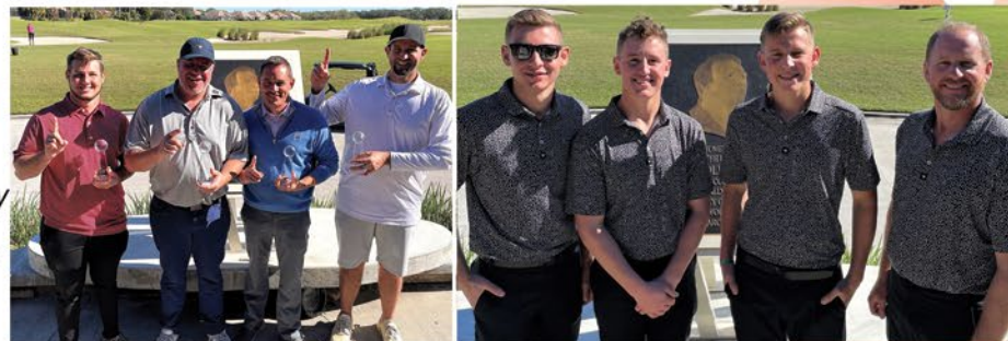
2022 Champs from NC

30 Teams came out on a brisk day in Sarasota for our 2nd annual tournament. A huge thank you to all who played and made it a memorable day!