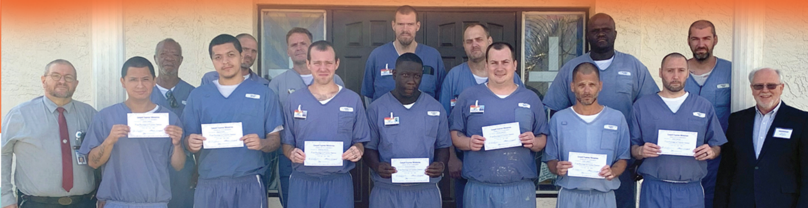
Certificates are handed out to inmates who complete the course