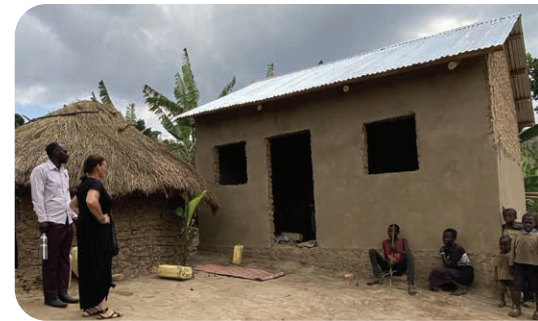
SHELTER UNDER CONSTRUCTION

15 Shelters Built 7 Under Construction 8 Pending Sponsorship