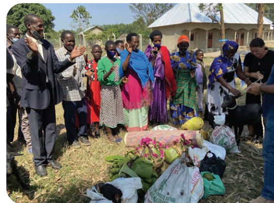
SHELTER RECIPIENTS REJOICE IN GIVING