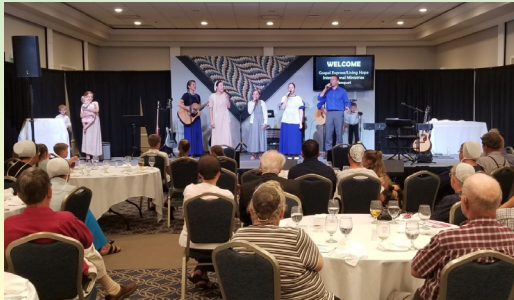
As 2021 rolled in, we realized we couldn't have our normal auction and revival meetings at Pinecraft Park due to COVID-19 restrictions. It seemed like last minute to us, but God opened the door to have 2 banquets and a

From the unknown (one door closes) to the favor of God (another door opens).