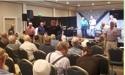
Offerings from both banquets came to $12,047 while the auction brought in $40,500. After expenses, the nondesignated proceeds will be divided between Gospel Express and Living Hope International. Truly God did exceedingly abundantly above what we asked.