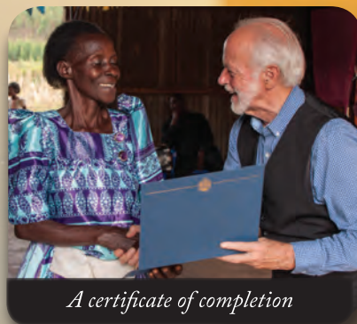
A certificate of completion

CONFLICT RESOLUTION - Breaking the chains of anger, bitterness, and unforgiveness.