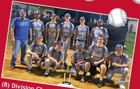
(B) Division Champs: Miller Concrete, Mifflinburg, PA