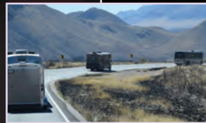
Someone had a birthday in Mexico