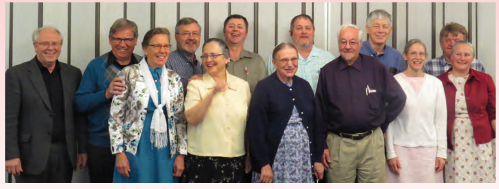
Seminar instructors at North Florida crusade - "Faithful men and women... entrusted to teach others."

(A Heart-Wrenching Prayer Request) My mother gave me up for adoption when I was a baby. When I turned 18 years old I contacted my mother and went to visit her. She informed me that I was a big mistake and she did not want to be any part of my life. She said, "Get Out!" So I left feeling so hurt and rejected. I really do want to forgive my mother, but it is so hard. Pray for me. ~anonymous(SC)