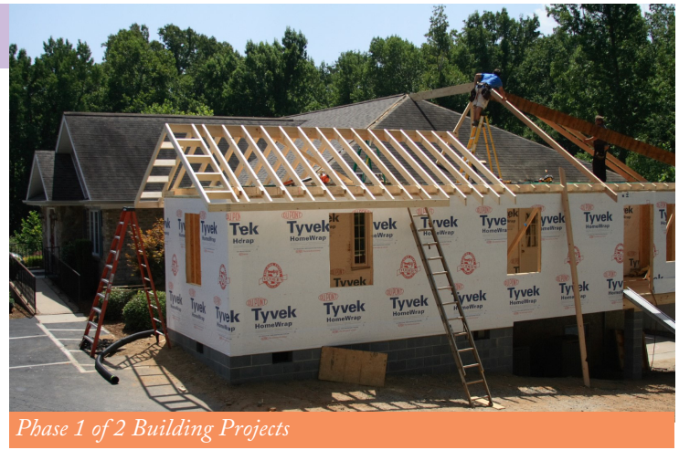
Phase 1 of 2 Building Projects

Phase 1 of the building plan is a 12 X 46 addition as seen in the photo. It will give us 2 more offices, some storage, and a conference/meeting room. Once this addition is complete we also hope to soon start on phase 2, which is a separate building behind the office for storage, an expanded Bible/Bible courses section, and additional housing for VS staff/house parents. We have started this project with vision,